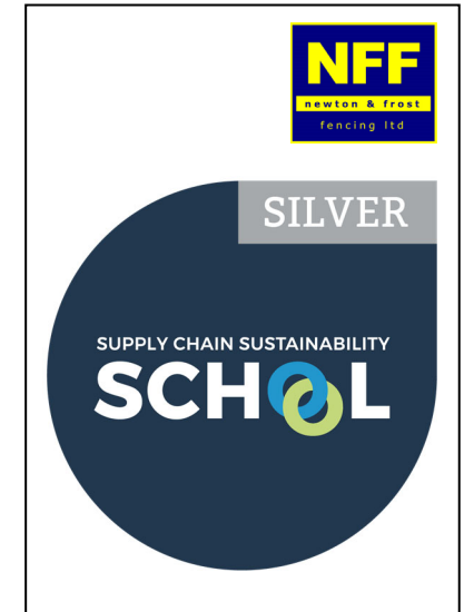
Supply Chain Sustainability School