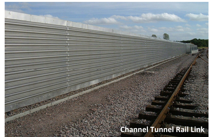
Channel Tunnel Rail Link