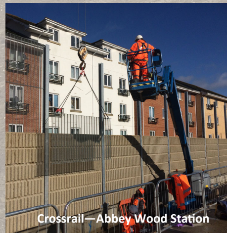
Crossrail—Abbey Wood Station