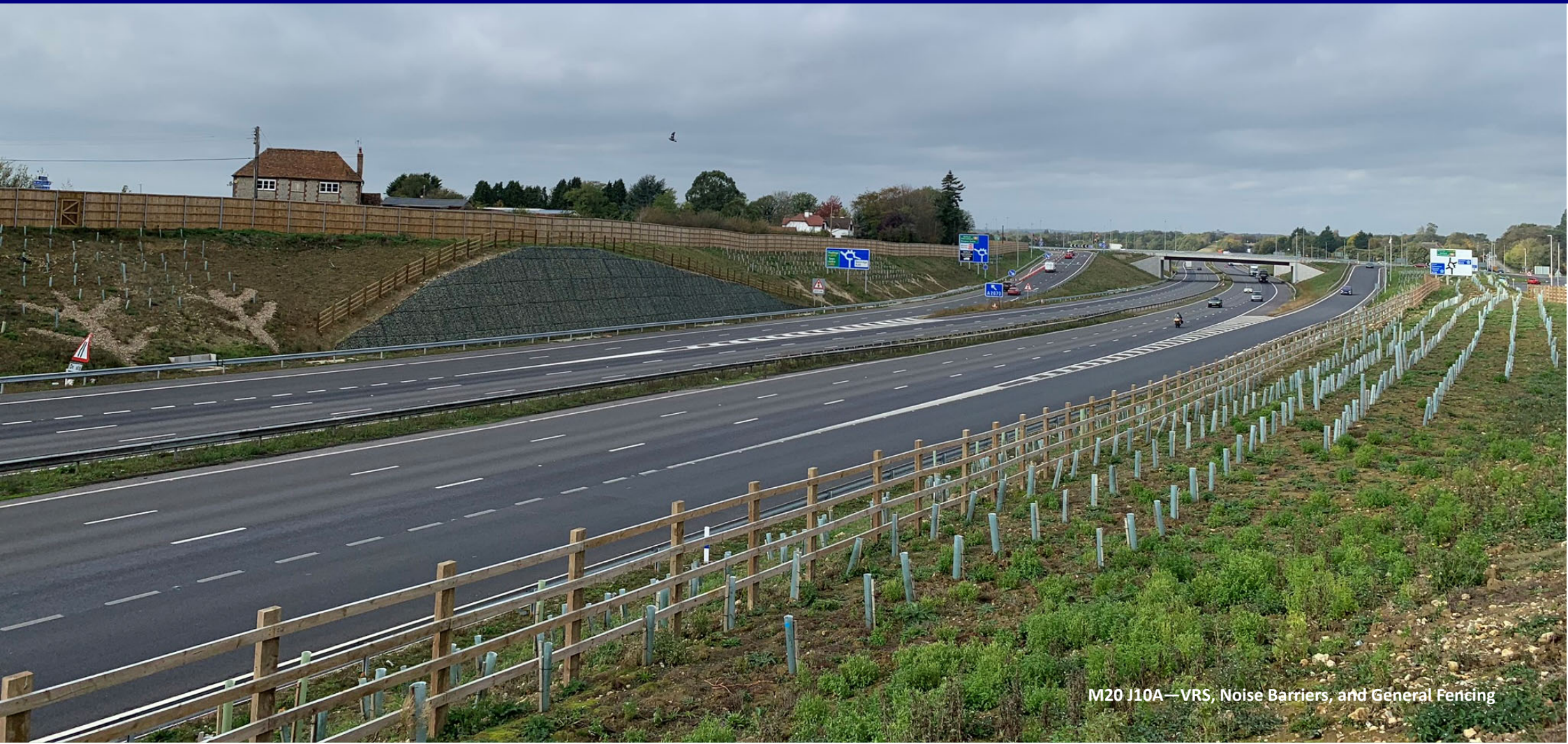
M20 J10A—VRS, Noise Barriers, and General Fencing

Delivering solutions to protect our futures