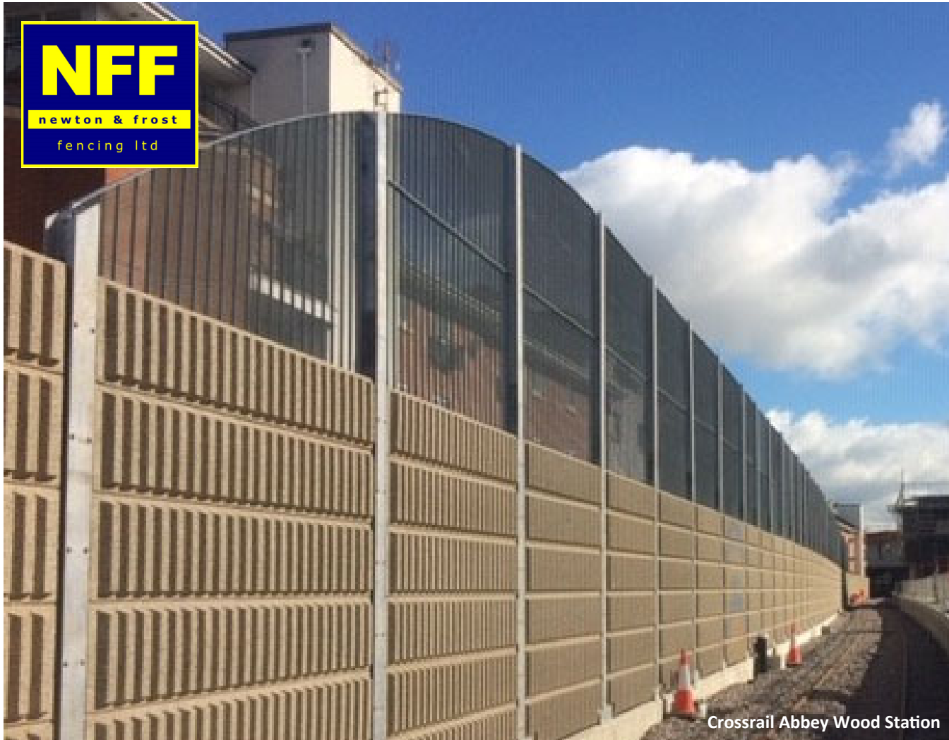
Crossrail Abbey Wood Station