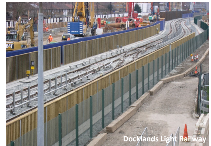
Docklands Light Railway