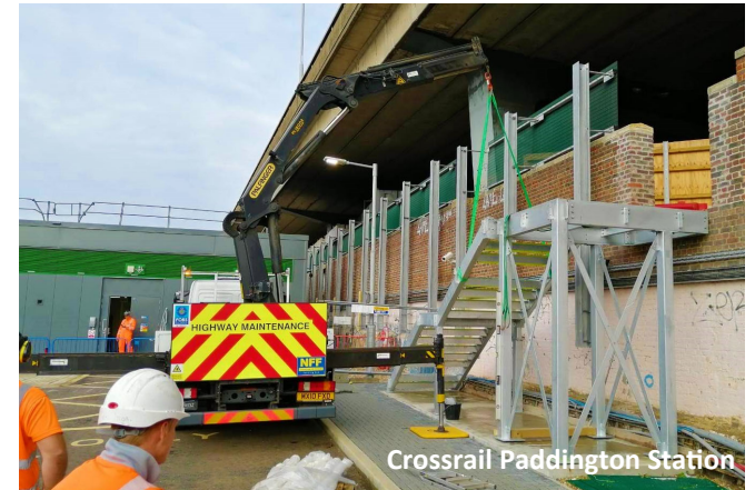
Crossrail Paddington Station

Newton & Frost Fencing Ltd hold the RISQS accreditation allowing us to work on projects on the rail infrastructure. We have carried out works that have included specialist noise barriers, high security fencing, emergency access solutions and parapets on Network Rail, Docklands Light Railway, EWR and Crossrail.