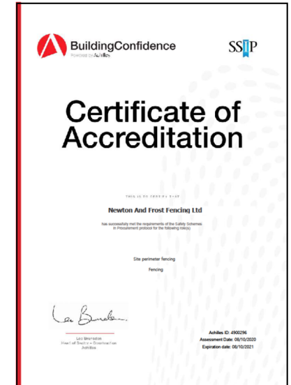
Achilles Building Confidence